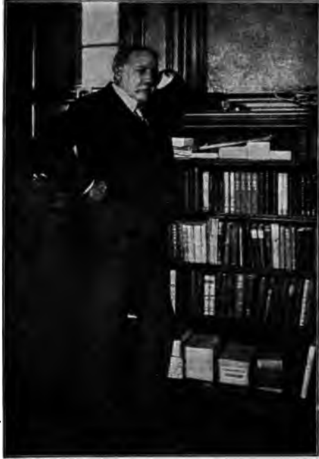
MR. HOWELLS in his Fifty-ninth Street Library Frontispiece from the Volume Literature and Life in the new Complete Edition of W. D. Howells Works